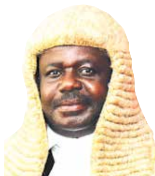
Sipiika wa Palamenti, Jacob Oulanyah

Bwe baatuuse mu disitulikiti y'e Kole, ababaka beetegeereza akawunti za SACCO ez'enjawulo ne bakizuula nti obukadde