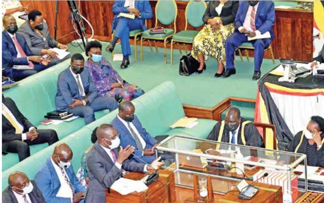
Ababaka nga bali mu Palamenti. Mu August omumyuka wa Sipiika, Among yasindika ababaka mu bitundu bye bakiikirira okulaba enkola ya sseente z'emyooga obuwumbi 53 ezaaweewwayo Gavumenti.

Newankubadde nga mu disitulikiti ezimu abatwala ebyobu-suubuzi baategeeza Ababaka nti sseente ezimu abazifuna baazizzaayo, nga mu muluka gw'Opeta gye bagamba nti bazzaayo obukadde busatu, Ababaka baagenze okutuuka ku akawunti yaabwe mu bbanka nga tezirabikako ate aba Kolo North baagen-