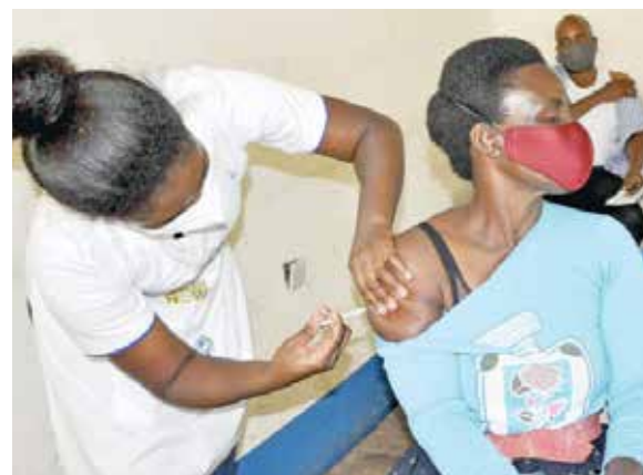
Omu ku basomesa abagemeddwa mu August. Enteekateeka za Gavumenti kwe kugema abasomesa 20,000 mu Kampala n'abalala 50,000 okwetooloola eggwanga ng'amasomero tegannagulwawo.

Omuwendo gw'abantu abakwatibwa obulwadde bwa ssennyiga omukambwe bwe gwakendede palamenti n'esalawo entuula zaayo ziddemu okutuula munda mu palamenti.