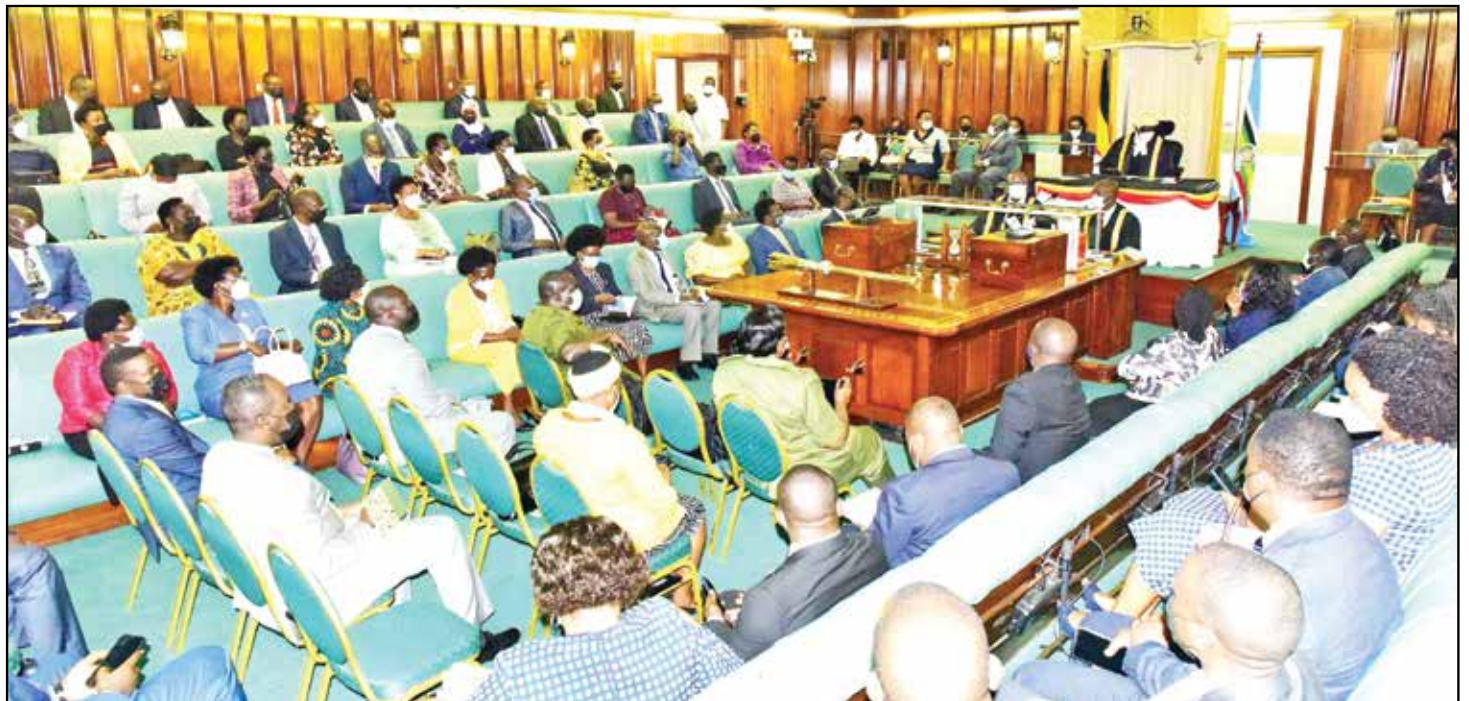
Ababaka nga batudde mu palamenti oluvannyuma lw'okussaawo amateeka agagoberwa ku Covid-19.