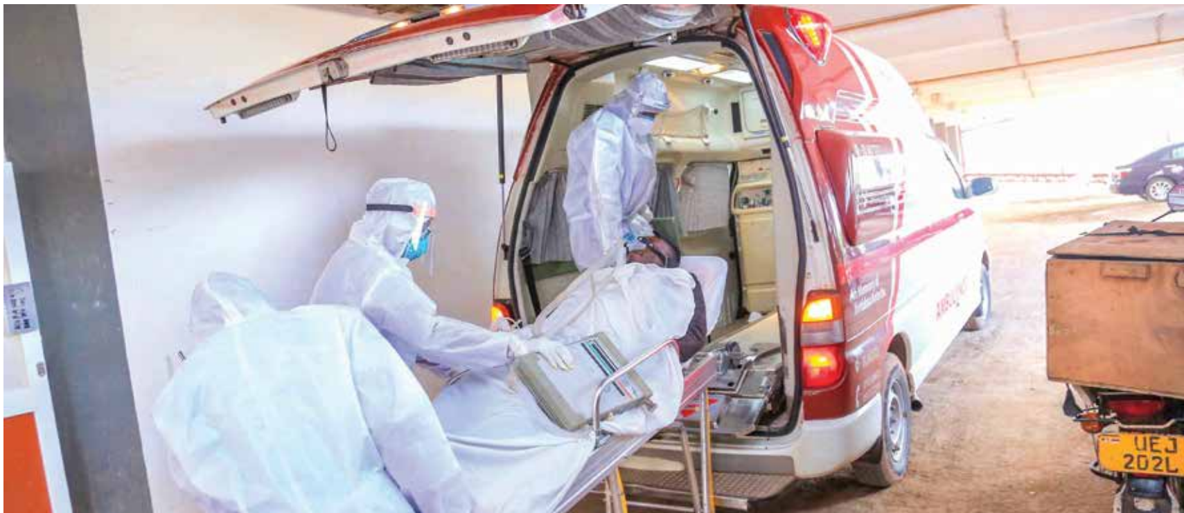
Omulwadde wa Covid-19 ng'atwalibwa okujjanjabwa. Ababaka bagamba nti ssente ezaawebwayo okussaawo ebifo omukung'anyizibwa abalwadde teziragibwako mbalirira.