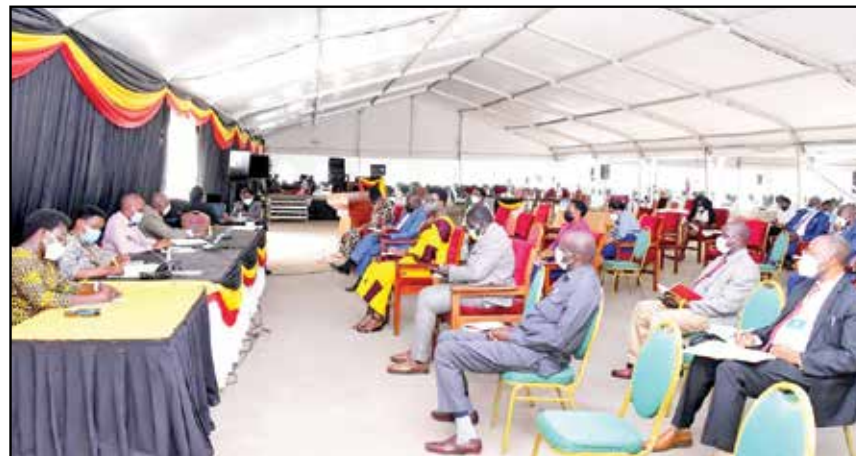
Ababaka nga batudde mu ttenti ezassibwa wabweru wa palamenti nga tewannasibwawo mateeka gagobererwa okwetangira Covid-19.

tako okugula obuuma bwe bakozeza okunaaba mu ngalo, okupima ebbugumu ly'omubiri ku buli mulyango oguyingira ku palamenti.